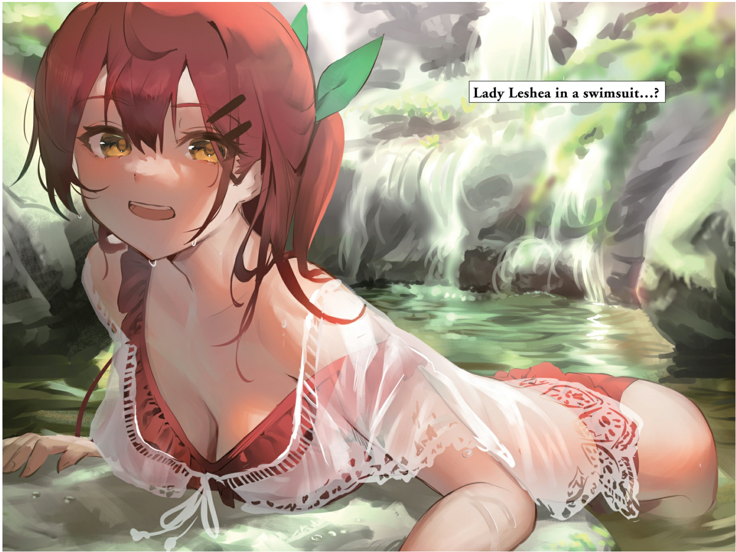
Lady Leshea in a swimsuit...?